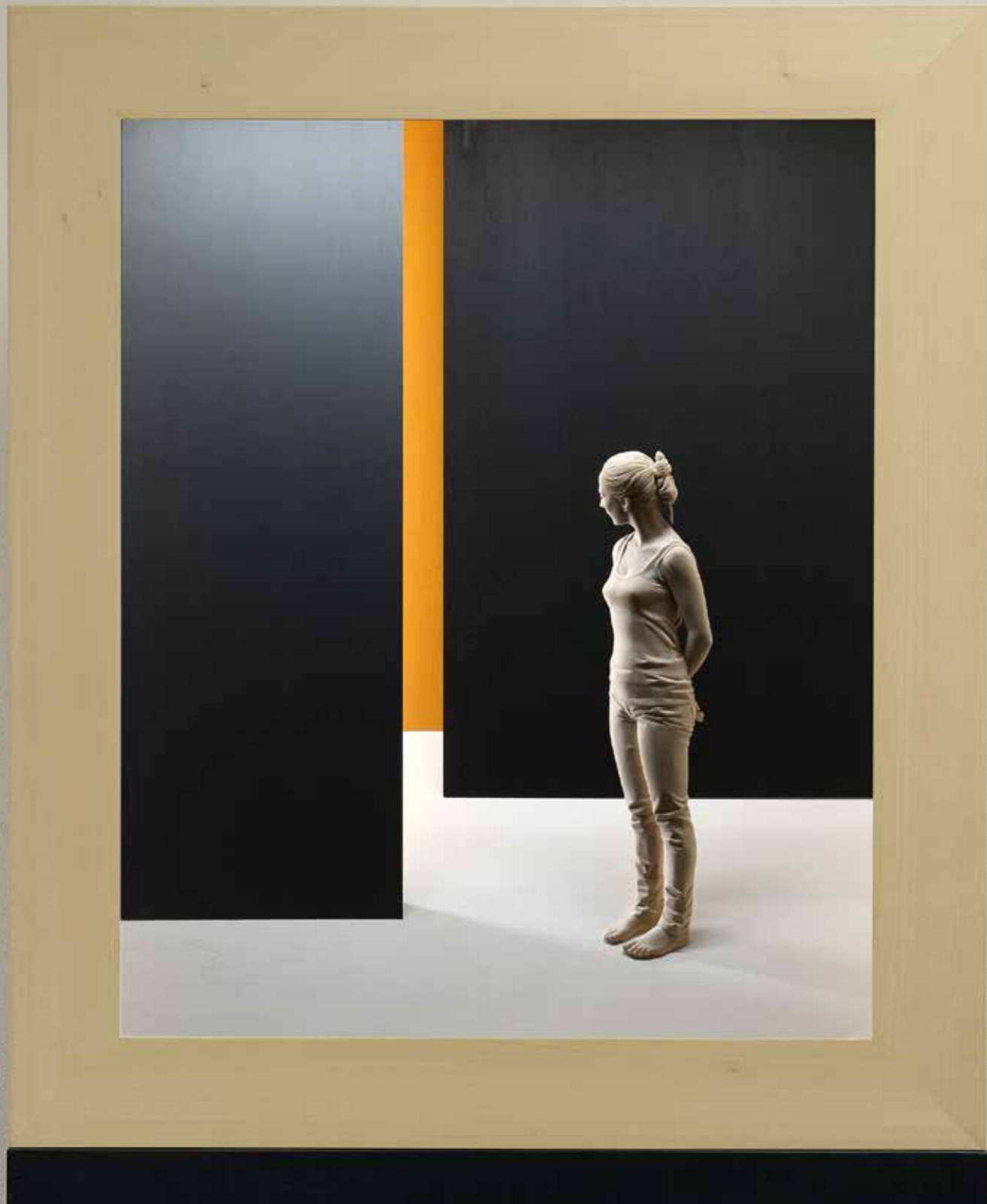
The Private zone 2015 Linden wood lightbox 70 x 60 x 19,5 cm